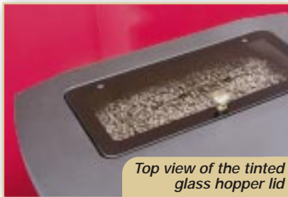
Top view of the tinted glass hopper lid

The Accentra Cast Iron Pellet Stove was designed to attractively accent your home while providing the technology and convenience of automatic ignition. Simply fill the hopper and set the control to your desired temperature. The Accentra will light itself and warm your home to the temperature keeping it constant by automatically adjusting its flame. The tinted glass hopper lid allows you to see the amount of fuel in the hopper without lifting the lid. Backed by our Harman Gold Warranty, the Accentra is loaded with the highest quality parts and durable cast iron. We are confident that your Harman Iron Stove will make you want to spend more time in the warmth of your home.